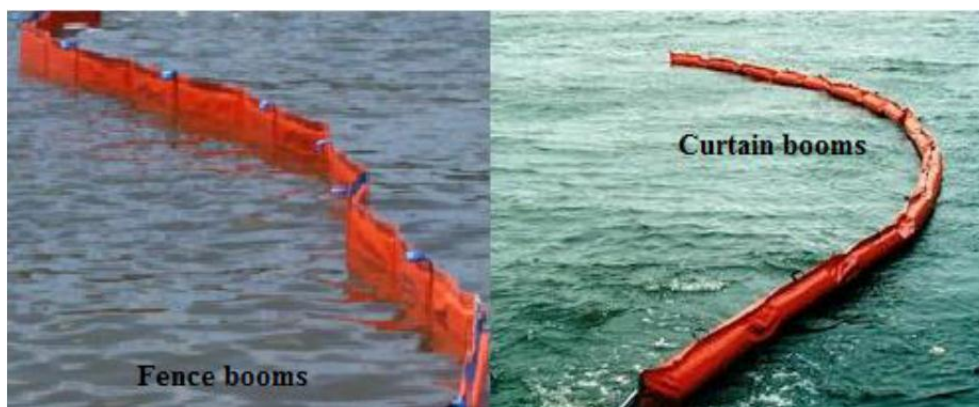
Fig. 2: The types of booms used to control the oil spill spread (Gong et al. 2014).

A research was conducted to design and fabricate a belt-type oil skimmer. The belt-type oil skimmer is then tested for its efficiency by using various types of belt ma-