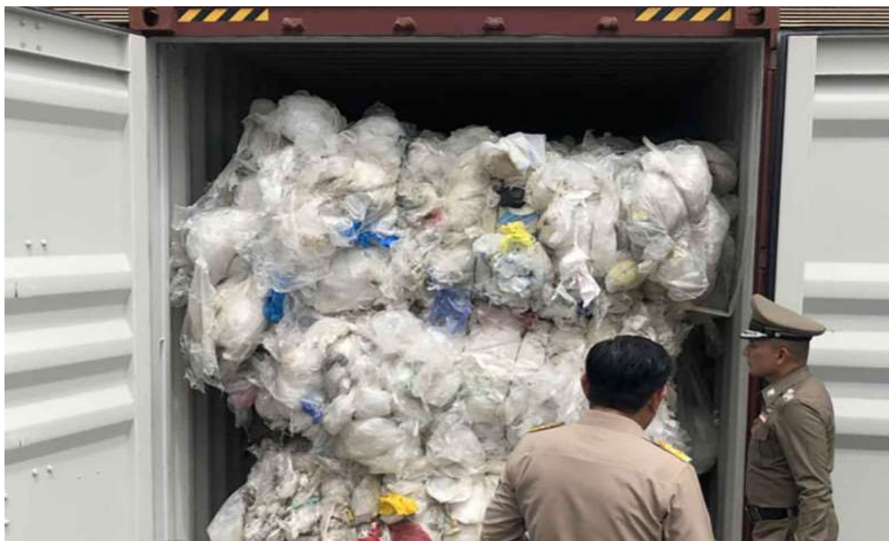
Fig. 2: Imported plastic scrap that is falsely declared.

The Plastic Scrap Management Phase II Action Plan (2023-2027) by the Ministry of Natural Resources (Ministry of Natural Resources and Environment 2023) aims to decrease and eliminate the use of plastic by switching to strong and environmentally friendly materials. Recycling 100% of plastic scrap is expected to be achieved by 2027. The plastic scrap management action plan has been designed to align with the 20-year national strategy (2018-2037) (The Royal Thai Government Gazette 2018) to achieve economic growth while maintaining an environmentally conscious quality of life.