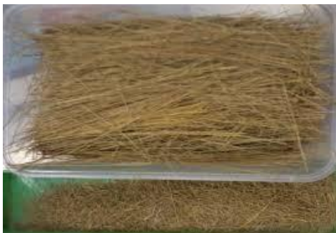
Fig. 10: Acoustic material from rice straw.