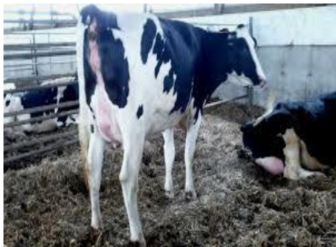
Fig. 2: Rice straw as bedding material for cattle.

Lots of parameters should be considered while designing a large-scale rice straw combustion system. These parameters are volatile matter content, the mean value, the possibility of moisture, agglomeration characteristics, ash composition, ash content, and energy content of the fuel. Various by-products like bottom ash, fly ash, etc. produced have economic value, and these may be further used in the manufacturing of bricks, cement, embankments, and construction of roads (Verma 2014) (Fig. 5).