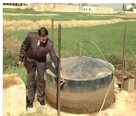
Fig. 7: Bio-gas from rice straw.