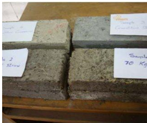
Fig. 13: Rice straw cement bricks.

after compaction. These samples were placed for curing purposes and water sprayed twice a day up to 7 days for the proper gaining of strength in bricks. It was investigated that bricks prepared by this method maintain compression stress up to 115 \text{ kg.cm}^{-2} moreover; the production cost reduced by 25% as compared to pure cement bricks (Allam & Garas 2010).