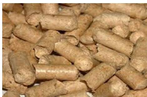
Fig. 6: Rice straw for pellets production.