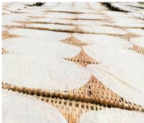
Fig. 14: Rice straw hand made paper.

biofuels. In India and other countries, local authorities can be more responsible in setting specific prohibitions. Some NGOs (Non-Government Organization) have also started microfinance in Bangladesh and Indonesia for small-scale renewable energy projects.