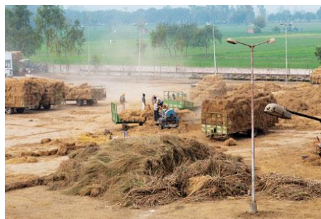
Fig. 5: Rice straw as combustion material.