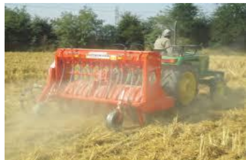
Fig. 1: Incorporation of rice straw in the field.

Paddy straw for mushroom cultivation: In 2017-18, India cultivated rice in an approximate area of 45.10 Mha and produced 111.01 MMT with a productivity rate of 3.52 MT.ha -1 . Mushrooms were first cultivated in India in Coimbatore by Thomas et al. (1943). As per the FAO (Food and Agriculture Organization) statistics, in 2016, India produced 29992 tonnes of mushrooms and ranked 5 th in the world in mushroom production. Cultivation of mushrooms requires rice straw with some special moisture, length, and temperature (Yoshiro & Duoug 2015, Kaushik et al. 2018).