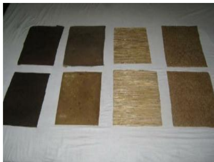
Fig. 12: Bio-composite of rice straw.

Rice straw-cement bricks: Rice straw is also being used for the production of lightweight cement bricks (Fig. 13) that are used as fillers in the construction of buildings (skeleton types). The burned product of biomass power plant left behind contains high silica contents and is used in the manufacturing of bricks (Vagg 2015). Allam & Garas (2010) investigated that a sun-baked mud brick without straw had strength less than 6 \text{ kp.cm}^{-2} , however, with the addition of straw, these bricks become three times stronger, about 20 \text{ kp.cm}^{-2} . Moreover, the straw used in the production of bricks also provides thermal insulation to it. Coarse and fine aggregates were batched by volume using wooden boxes with the desired volume. Cement was added by weight using only whole bags of 50 kg to ensure uniform proportions of mix. The chopped rice straw was added to the mixture according to the previously mentioned quantities. The dry mixes were batched outdoors in a rotating power-driven revolving mixer of 100 liters capacity before adding water. Then the bricks were molded and vibrated and then de-molded immediately