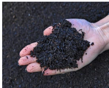
Fig. 9: Bio-Char from the rice straw.