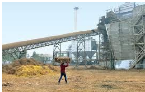
Fig. 4: Power generation from rice stubble.

Rice straw for bioethanol production: As population increases, the demand for petroleum, diesel, coal, etc.