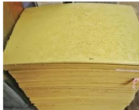
Fig. 11: Cardboard of rice straw.