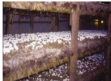
Fig. 3: Rice straw for mushroom cultivation.