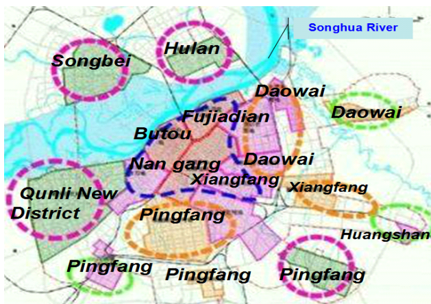
Fig. 4: Different district of Harbin in three periods.

Data sources: The data come from Harbin Statistical Yearbook (2011), China City Statistical Yearbook (2011), China Population Statistical Yearbook (2011), the report of the city survey group of Harbin, relevant literatures and Internet.