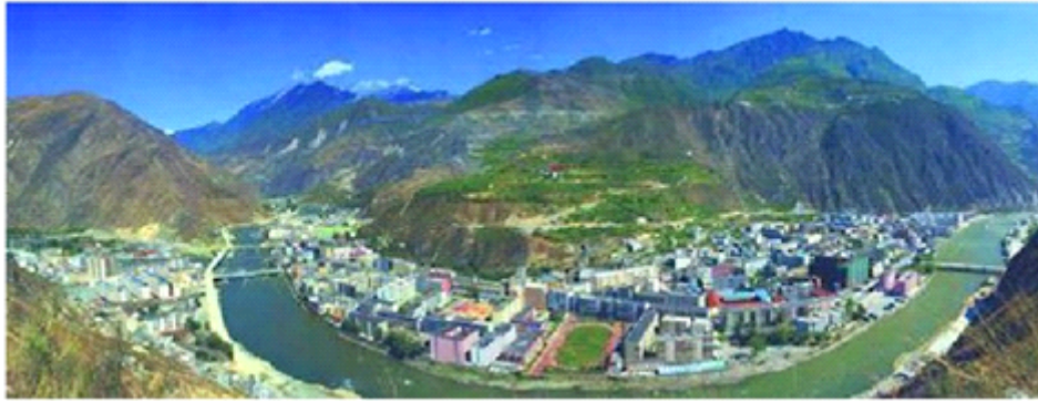
Fig. 1: Urban spatial pattern of Wenchuan, Sichuan, China.

tial pattern of Wenchuan due to its special geographical position.